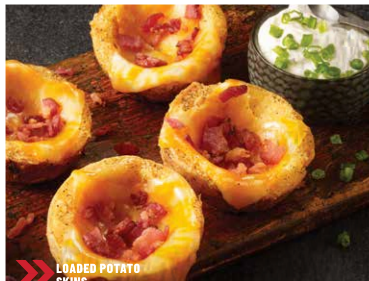
LOADED POTATO SKINS