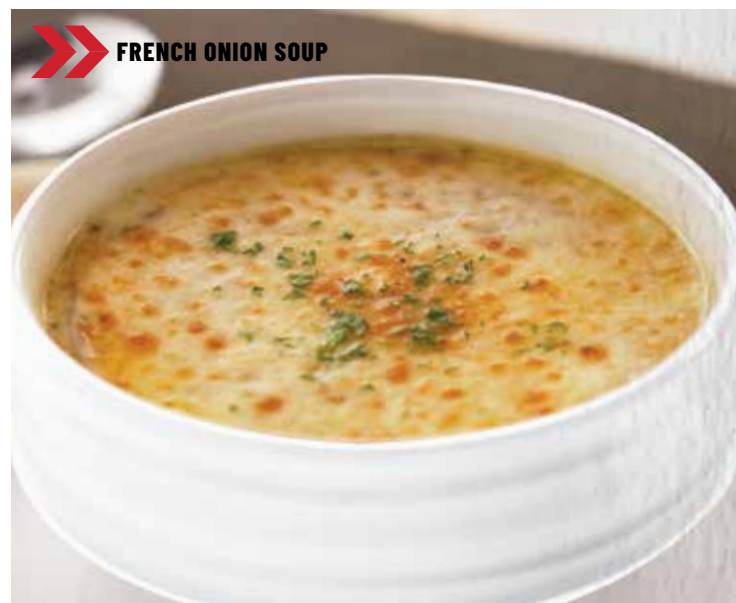
FRENCH ONION SOUP