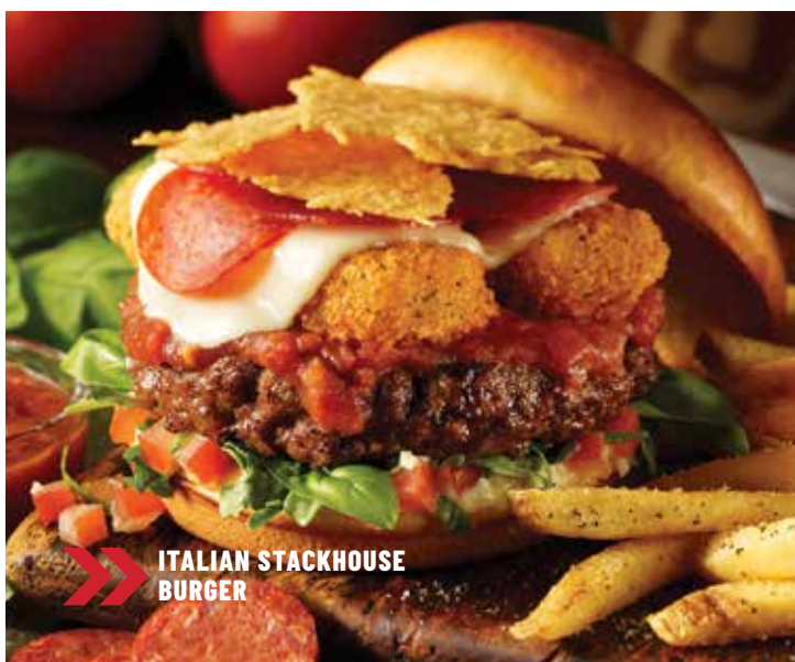
ITALIAN STACKHOUSE BURGER