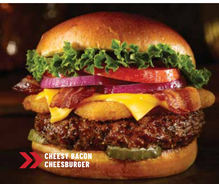
CHEESY BACON CHEESEBURGER