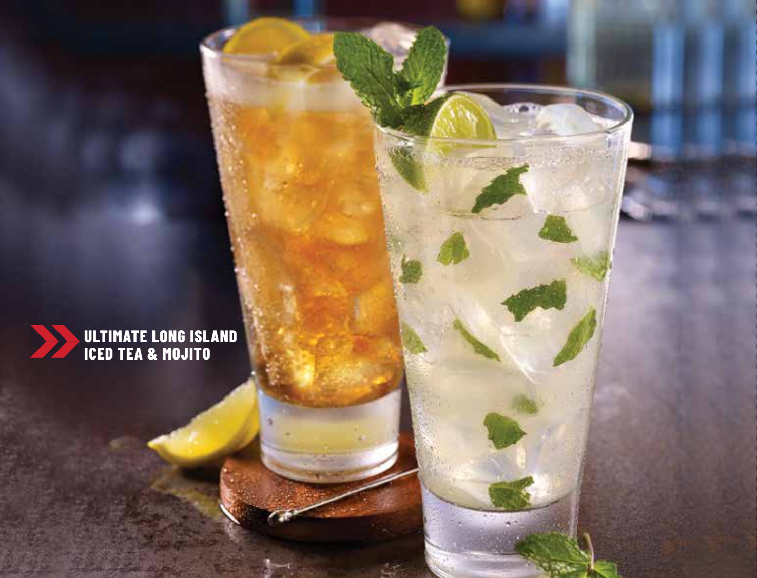
ULTIMATE LONG ISLAND ICED TEA & MOJITO