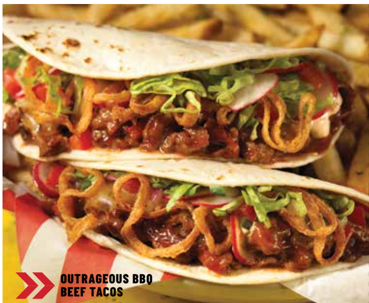
OUTRAGEOUS BBQ BEEF TACOS