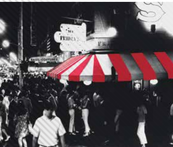
The first TGI Fridays in New York.