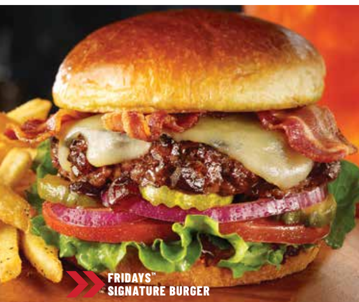
FRIDAYS™ SIGNATURE BURGER

Descriptions of dishes may not contain detailed information on all of the ingredients. If you suffer from a food allergy or intolerance please inform your server and ask for our allergen menu. We can not guarantee an allergen free environment or products.