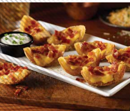
Fridays invented Loaded Potato Skins back in 1974 – and we still do them best!