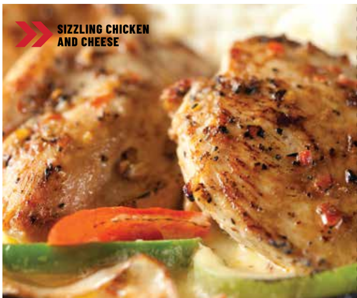
SIZZLING CHICKEN AND CHEESE