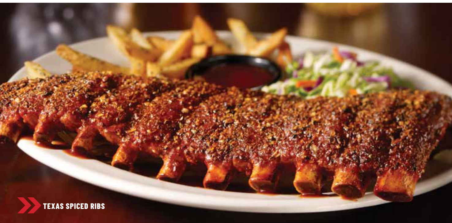
TEXAS SPICED RIBS