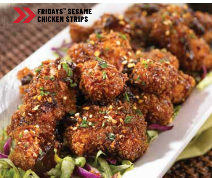
FRIDAYS™ SESAME CHICKEN STRIPS