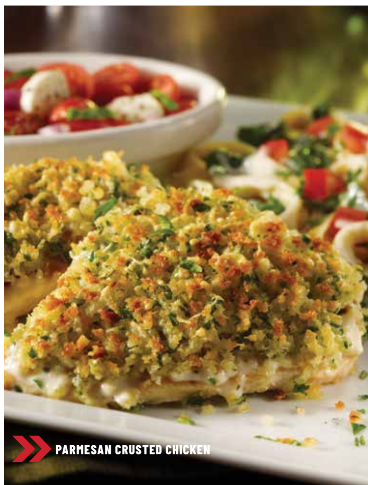
PARMESAN CRUSTED CHICKEN